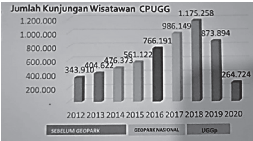
Figure 2. Tourist Visit Data for Ciletuh-Palabuhanratu Geopark

Based on the table above, it can provide an overview of the progress of the economic sector of the community in the region Geopark Ciletuh-Palabuhanratu before the area was recognized by UNESCO Global Geopark and before it was recognized by Unesco Global Geopark. The table explains that there has been a significant change in the economic sector after becoming a Unesco Global Geopark, namely the creation of new business fields. Therefore, the vision of the Ciletuh-Palabuhanratu Geopark in human welfare is in line with the mission. The economic sector is one of the most important variables assessed by the assessor because it is one of the requirements as a Geopark and is the most important variable in maintaining its status as a UNESCO Global Geopark.